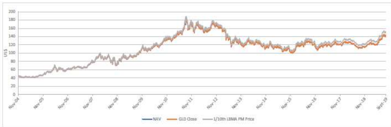
Share price & NAV v. gold price – November 18, 2004 to September 30, 2019

The following chart provides historical background on the price of gold. The chart illustrates movements in the price of gold in U.S. dollars per ounce over the period from 18 November 2004 to 30 September 2019, and is based on the LBMA Gold Price PM (since 20 March 2015) and the London PM Fix (prior to 20 March 2015).