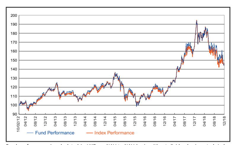
Fund performance is calculated in HKD on NAV-to-NAV basis without dividend reinvested. Index performance is price return.